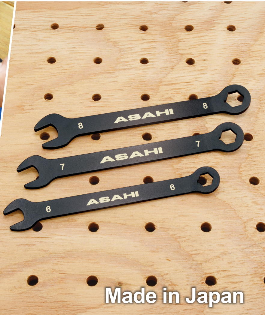
Made in Japan